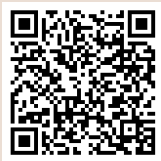
Salem Blog Post