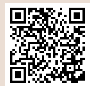
Smith Creek Village Post

“Such a great result from this blog yesterday, we are inexplicably grateful! Thank you” -Silver Falls Hospitality