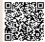
Kitsap IG Reel