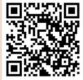
Curry County Blog Post

“All the content was great! I was extremely happy with the blog post, very thoughtful and well done. The other content was great as well . . . I have no concerns about the deliverables, all on time and done very well- even great shot selection, you have a good eye!” - Miranda Plagge, Travel Curry County