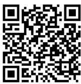
River Inn Blog Post